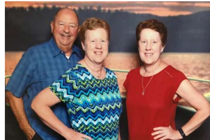
Waterset | http://www.watersetonline.com/waterset/