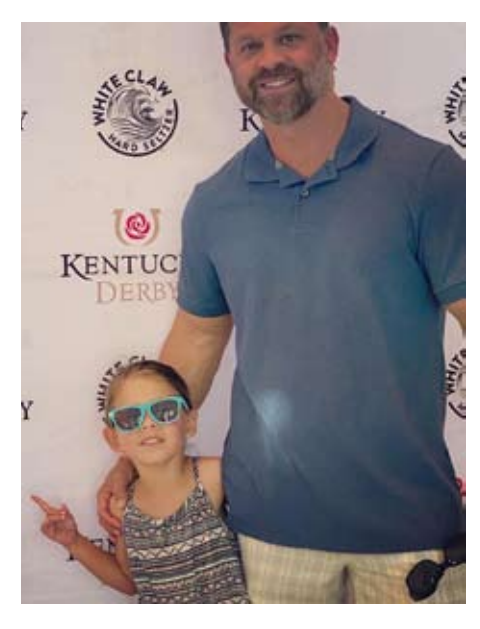
Waterset | http://www.watersetonline.com/waterset/