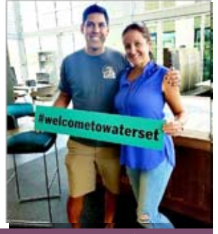
more reasons to smile on page 5