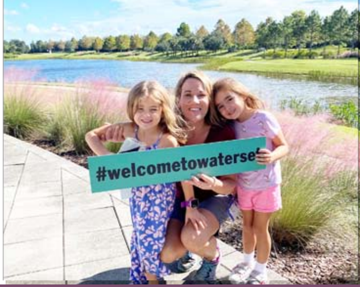
Your Community Information Resource Guide Support the Advertisers that Support Our Newsletter