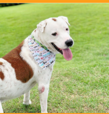
August 26 was National Dog Day! Check out some of our adorable #dogsofwaterset!